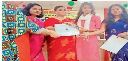
छात्राओं को पुरस्कृत करते शिक्षक।