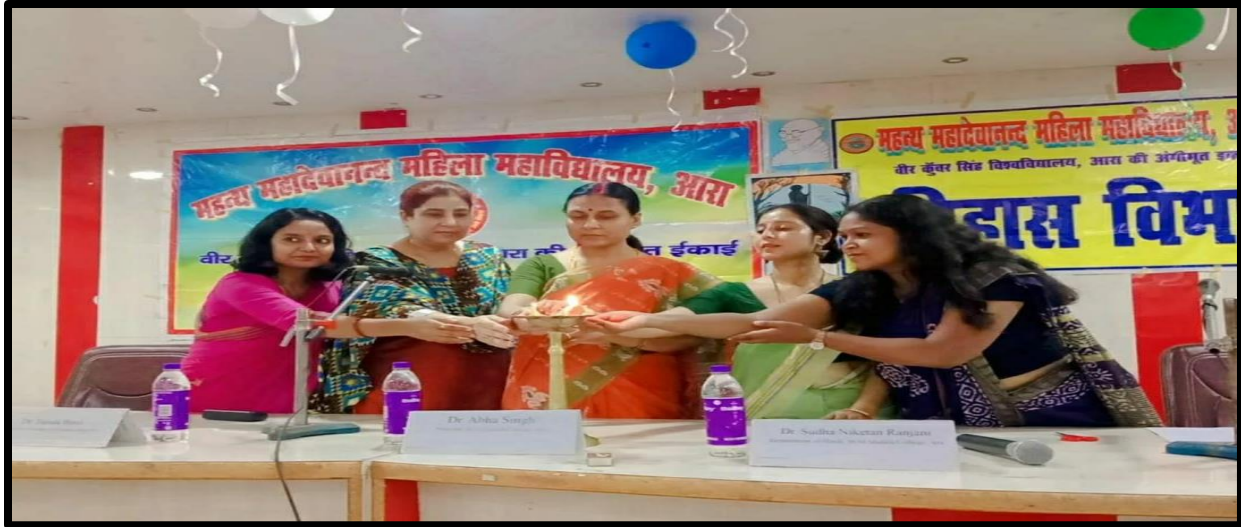
Lamp Lighting ceremony